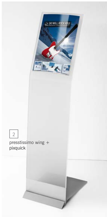
2 prestissimo wing + pixquick

prestissimo wing corpo in acrilico bisatinato prestissimo wing corpo aus beidseitig satiniertem acrylglas prestissimo wing corpo made of both side satin acrylic