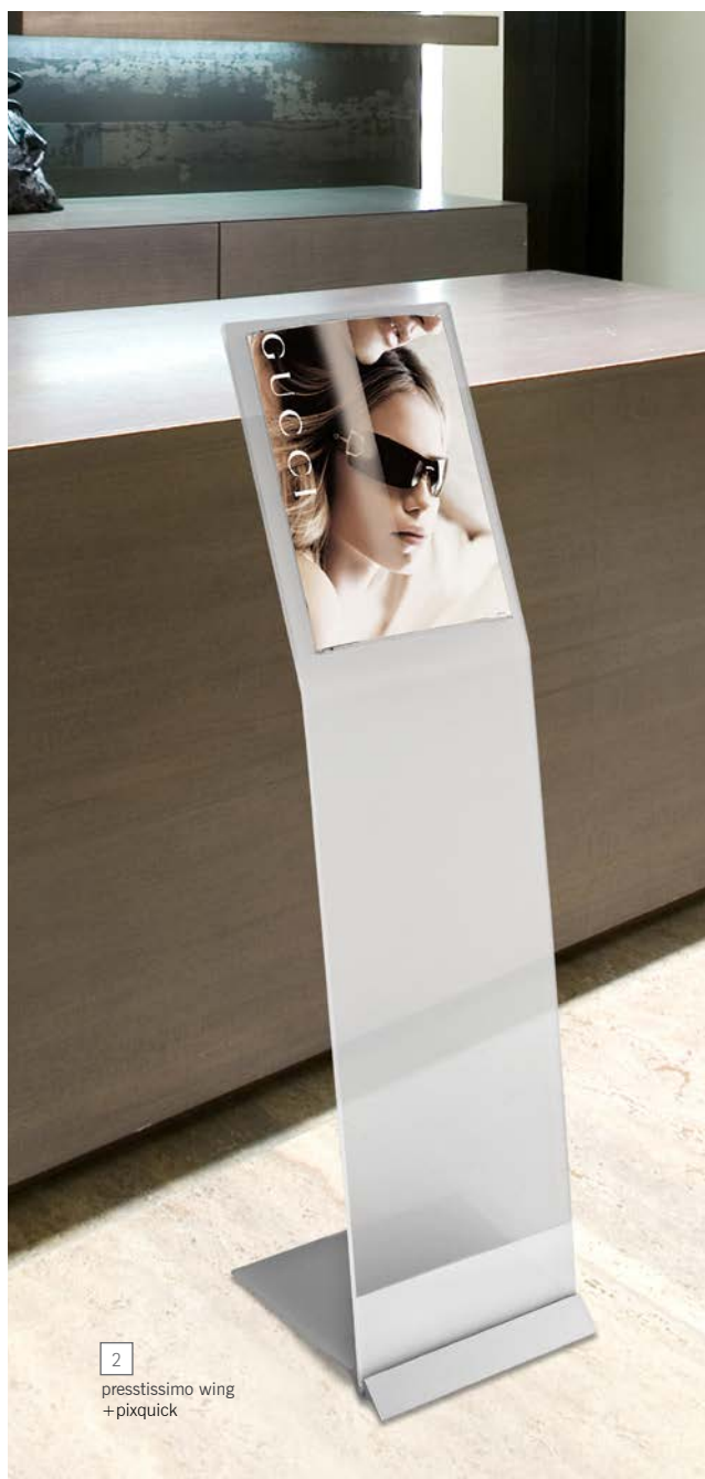
2 prestissimo wing + pixquick