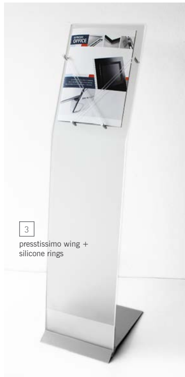
3 prestissimo wing + silicone rings

prestissimo wing: acrilico bisatinato con supporti in alluminio anodizzato e anelli in silicone per formati A4 e US letter. prestissimo wing : beidseitig satiniertes acryl mit silber eloxierten aluminiumhaltern und silikon o-ringen für format A4 und US-letter. prestissimo wing: both side satin acrylic with silver anodized aluminium supports and silicone o-rings for format A4 and US-letter.