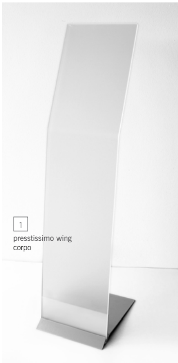
1 prestissimo wing corpo

prestissimo wing corpo in acrilico bisatinato prestissimo wing corpo aus beidseitig satiniertem acrylglas prestissimo wing corpo made of both side satin acrylic